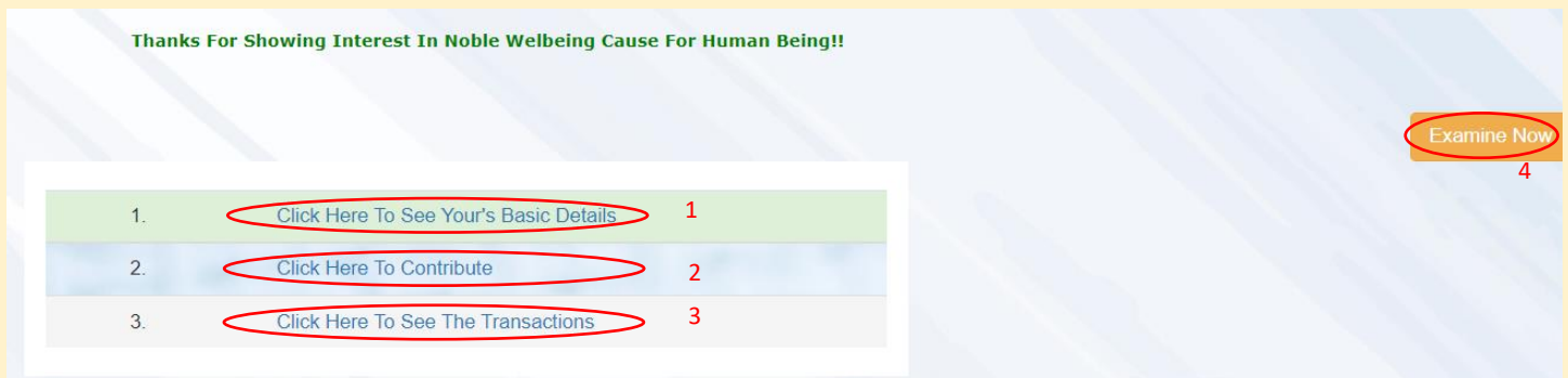
Figure. 1- Sponsor dashboard

The following functionalities have been provided with the sponsor's dashboard.